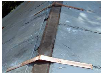
Fig 1. Screw or nail the copper fixing straps to your roof tiles at approximately 400 - 600mm centres.

We recommend a minimum of 75mm overlap on your roof ridge joints, with a silicone sealant in-between.