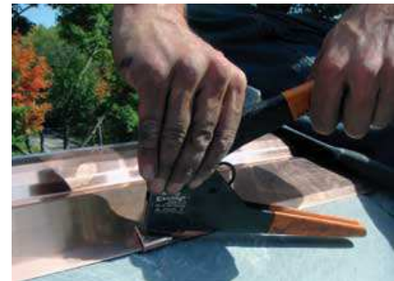
Fig 5. Use copper pop rivets to secure the roof ridge to the straps.