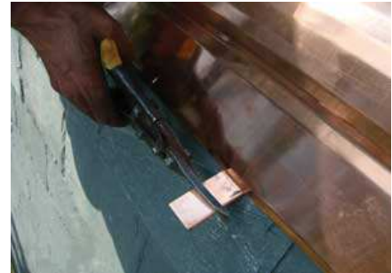
Fig 2. Sit the copper over your ridge and trim the straps so that approximately 20mm is left exposed.