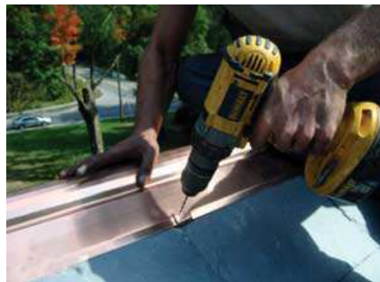
Fig 4. (step 4 & 5 optional) Drill through each strap and copper roof ridge.